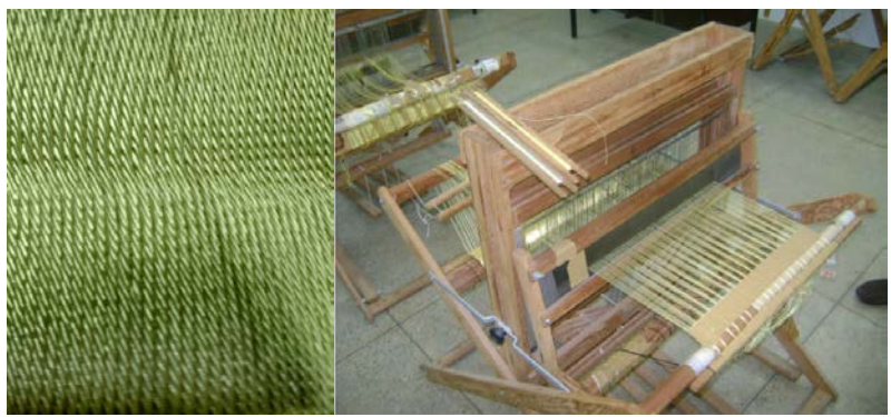
Figure 2- Fabric manufactured using handloom machine