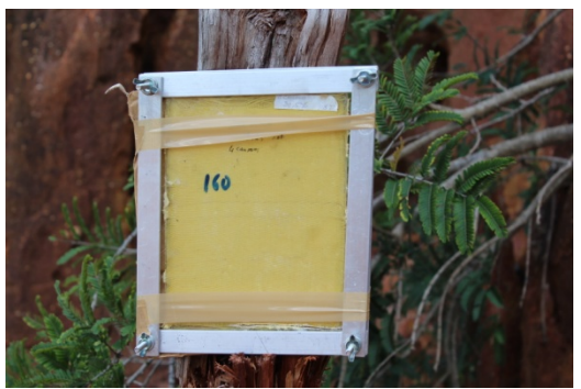
Figure 3- Sample fixed for gunshot test