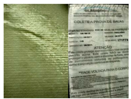
Figure 1- nonwoven fabrics for bulletproof