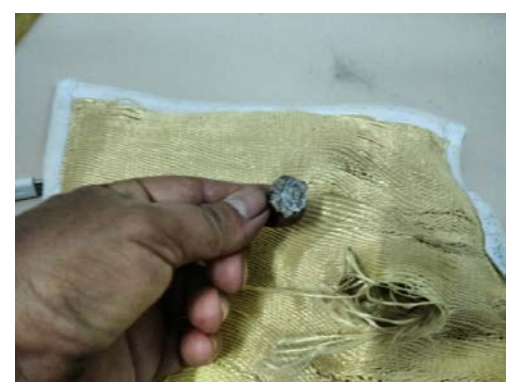
Figure 5- Fabric bulletprof sample after gunshot test

The performance of the composite under gunshot test for polyester reinforced kevlar fabrics of the composite was performed in a 3 different samples. The target is composed of a ballistic plate, a vest structure and a polyurethane foam. After gun shot test all parts were evaluated in relation to the degree of perforation and damage. For all composites the ballistic plates acting after the shooting test, all the ballistic plates acted to support the bullet and even after different calibers did not present a critical fracture. These results are indicative that the developed composites are efficient for use as a ballistic plate (figures 6 a 8). The profile of damage after visual analysis as possible observed delamination under hight impact, but not broken. This result is indicative that the material developed can be used in shields, if the dissipation impact energy of the projectile's is taken into account. Although perforation in the plate occurs the projectiles were housed in the structure of the bulletprof.